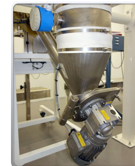
Low product inlet height.